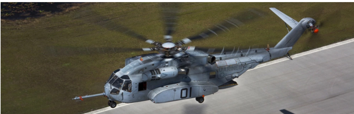
The CH-53K King Stallion.

The Pentagon will begin the program's FRP phase with 10 Lot 7 aircraft in FY23. However, technical deficiencies identified during testing led the Navy to slow procurement temporarily, cutting the planned rate of near-term deliveries.