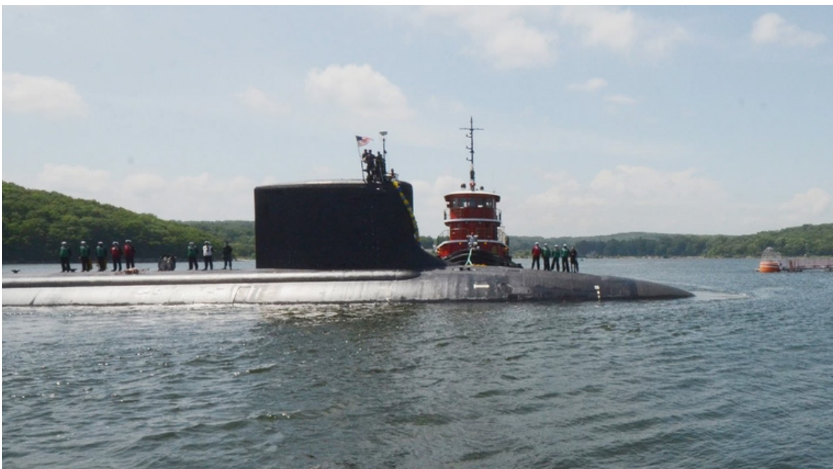
USS Virginia.

In early 2023, Australia agreed to acquire up to five boats under the AUKUS deal. Australia will buy three Virginia class subs in the early 2030s, two from U.S. stock and one new-build (as reported on The Warzone in July 2023), with the option to buy two more. All told, 21 submarines are currently in service. The projected Virginia class production run appears set at 52, which will help the U.S. Navy reach its force structure goal of 66 SSN attack submarines of all classes.