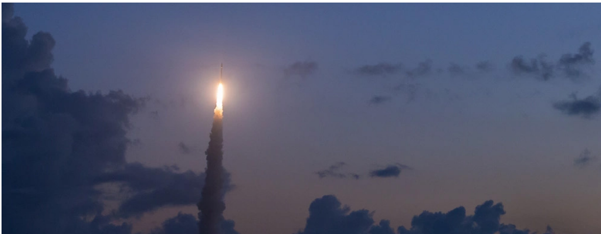
SBIRS GEO-6 satellite launch.

An aspect of Next-Gen OPIR that has recently come to light is the future acquisition of LEO satellites with OPIR payloads to augment the Next-Gen OPIR system. In September 2021, L3Harris completed its PDR of a new missile warning satellite under development for the U.S. Space Development Agency. As an aspect of the Next-Gen OPIR program, the satellites will provide the capability to detect and track ballistic and hypersonic missiles via overhead persistent infrared sensing from low-Earth orbit. In October 2020, the SDA awarded $193 million to L3Harris and $149 million to SpaceX to build four satellites each under the Tracking Layers Tranche 0 effort. In July 2022, the SDA awarded contracts valued at $1.3 billion for 28 Tracking Layer Tranche 1 satellites to Northrop Grumman and L3Harris. The contractors will manufacture 14 satellites each for the network.